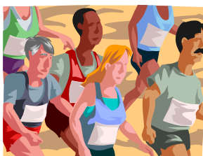
Set your Pace For this Inaugural race!

(flat for 4 k approx) then climbs to meet Buchanan, turning right on Buchanan into Robinson Place, and returning along Buchanan to the turnaround at far south end of Buchanan. Heading back along Buchanan to meet Beach