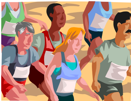
Early Registration up to April 19th—$50.00 Late registration— April 20th and after—$60.00

Other active initiatives to help mark the Centennial year as the most active centennial are the in training programs, Peachland 100 Treadmill Challenge, Beach Ave. 100, Peachland Centennial Year Active 100 Challenge, Peachland Centennial Year 100 Walks and Hikes Challenge. For more information on how to participate or to be a volunteer, call us at 250-767-2133.