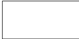
Standing at the foot of the grave looking up at the marker