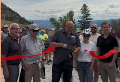
Opened the new Peachland to West Kelowna Multi-Use Trail

Let's take a look at some highlights from 2025