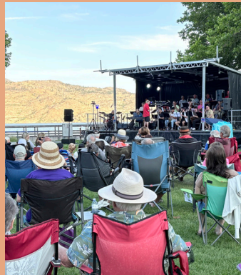
Launched Summer Series concerts in Heritage Park