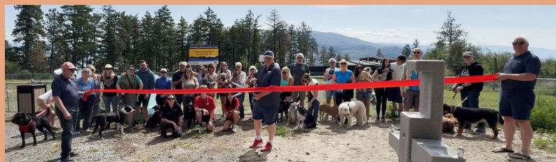
Completed construction of Sanderson Dog Park

Let's take a look at some highlights from 2025