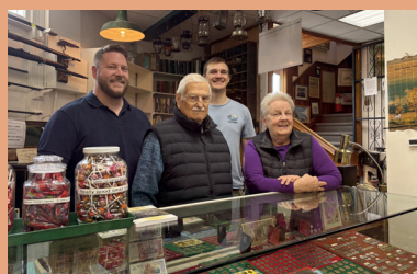
Opened the visitor centre in renovated Peachland Museum