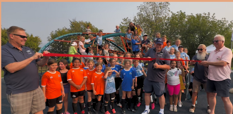
Completed the multi-phase Turner Park Improvements