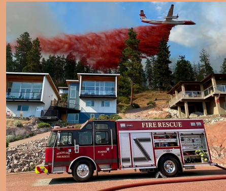
Fought not one, not two but THREE wildfires in Peachland