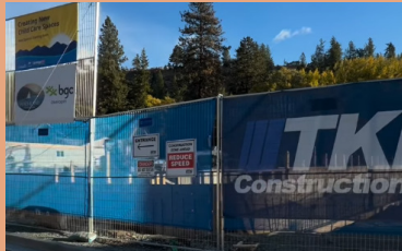
Construction started on the new childcare centre