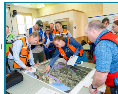
Peachland staff take part in regional readiness training in May

Peachland is at STAGE 3 Water Restrictions peachland.ca/water