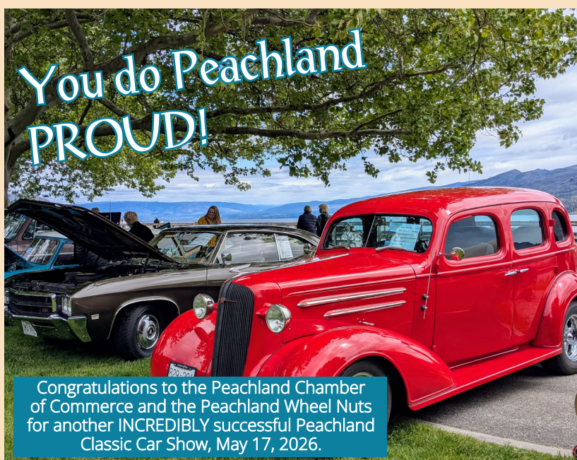
Congratulations to the Peachland Chamber of Commerce and the Peachland Wheel Nuts for another INCREDIBLY successful Peachland Classic Car Show, May 17, 2026.

Council gave first three readings to the District's Election Sign Bylaw and an amendment to the Bylaw Enforcement Bylaw to establish clear and consistent regulations for placement, timing, size and display of election signs in Peachland, as well as associated contraventions and penalties. Council will consider adoption of the bylaws at an upcoming meeting.