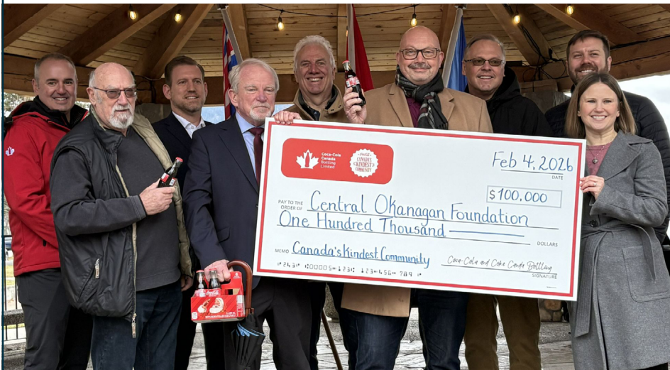
February 4, 2026: Peachland was named CANADA'S KINDEST COMMUNITY in Coca Cola's nationwide contest. Peachland was selected out of nearly 800 Canadian communities. The Central Okanagan Foundation will be awarded $100,000 which will be used to support Peachland charities. Read some of the wonderful stories of kindness and find out more about the contest at coca-cola.com/ca/en/offerings/holiday/kindest-community .