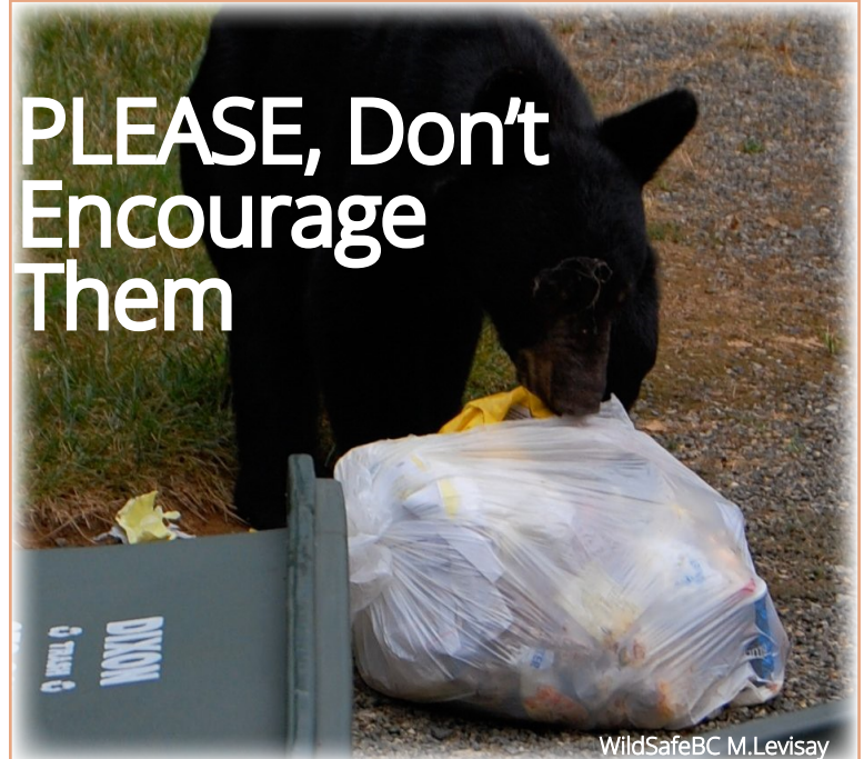
WildSafeBC M. Levisay

PEACHLAND FARMERS & CRAFTERS MARKET Every Sunday, 10 am to 2 pm beginning May 24 Heritage Park, Peachland - Beach Avenue peachlandfarmersandcraftersmarket.ca