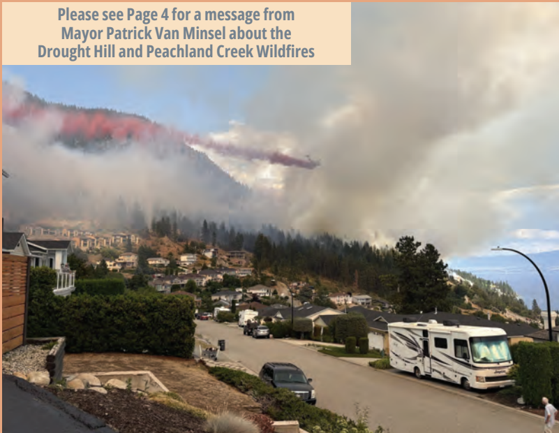
July 30, 2025 Drought Hill Wildfire