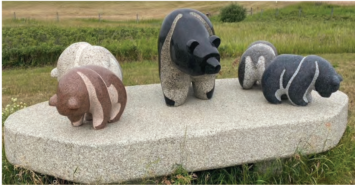
FOUR DIRECTIONS BEAR FAMILY: a mother bear and her four cubs of differing colours, symbolizing the underlying unity of humanity despite surface differences.